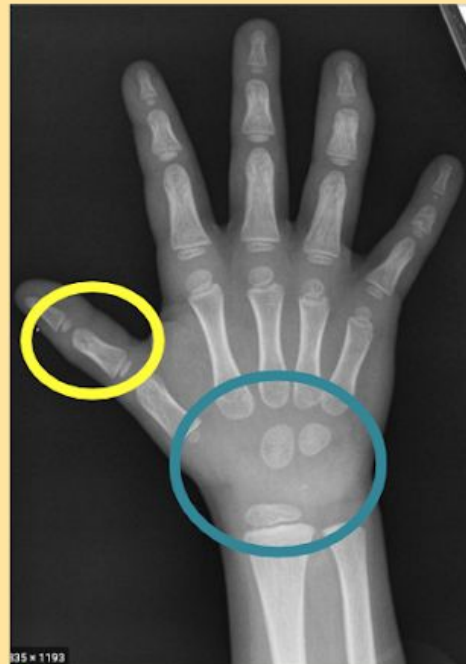
4 year old