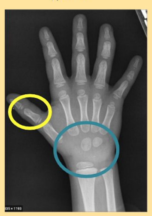
4 year old